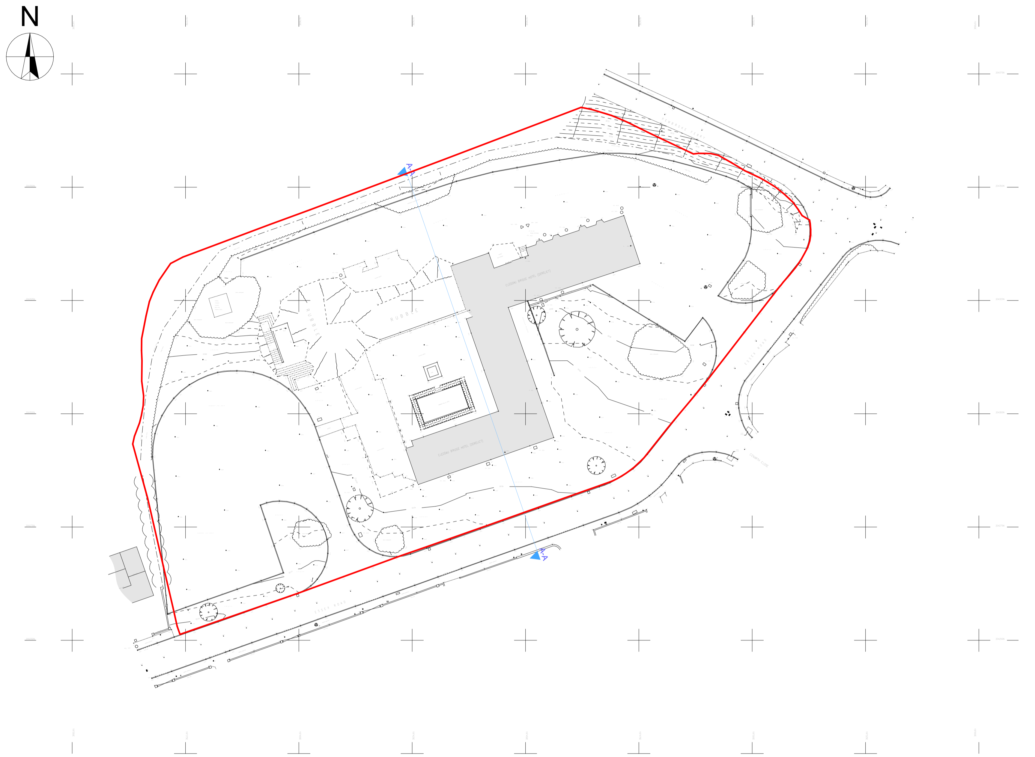
Topographical Survey 1:500