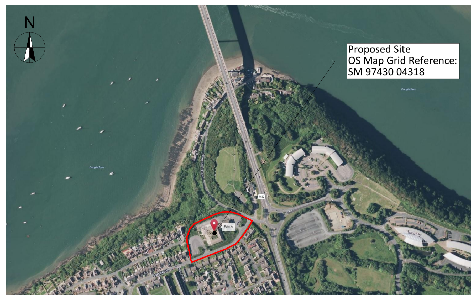
Aerial View NTS