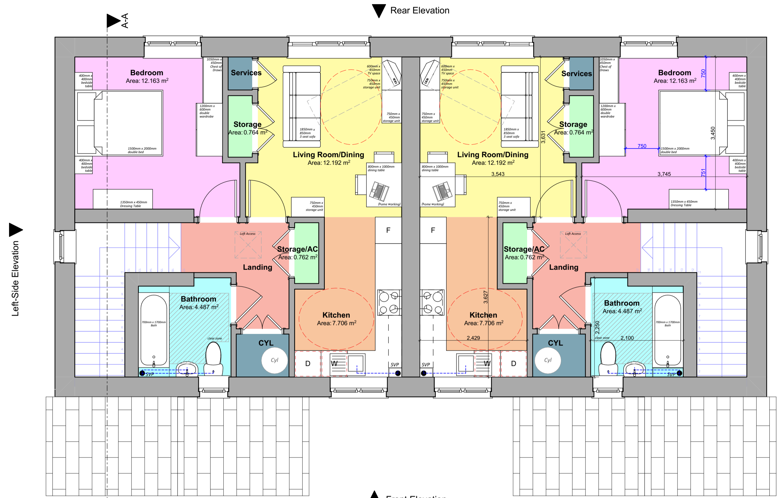
Front Elevation First Floor Plan 1:50