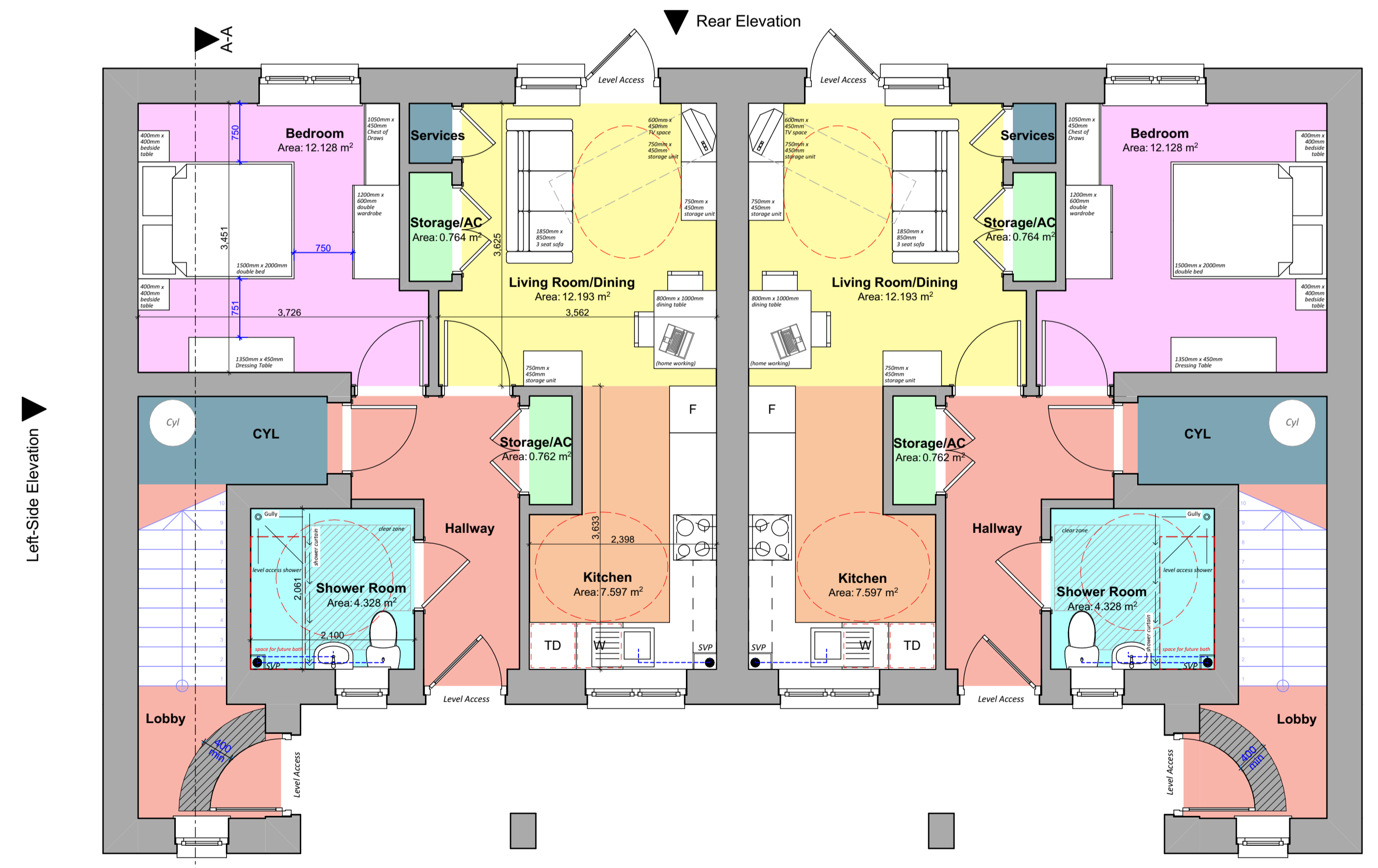
Front Elevation Ground Floor Plan 1:50