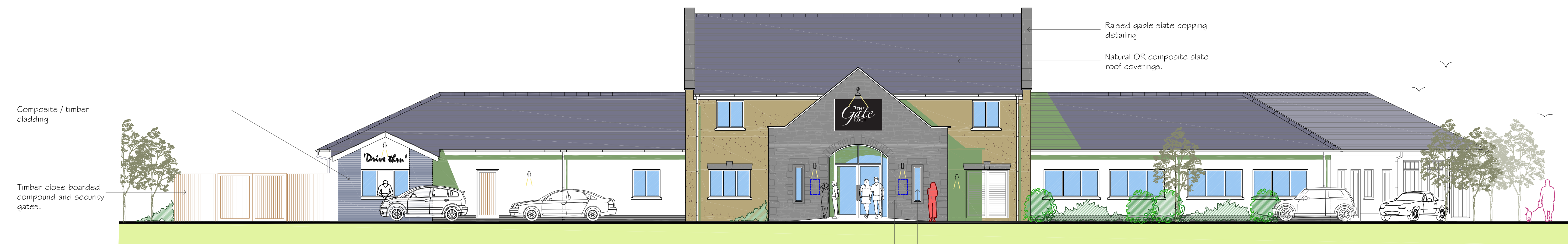
Proposed North East Elevation - 1:100

Arrow slit window detailing with cut stone banding.