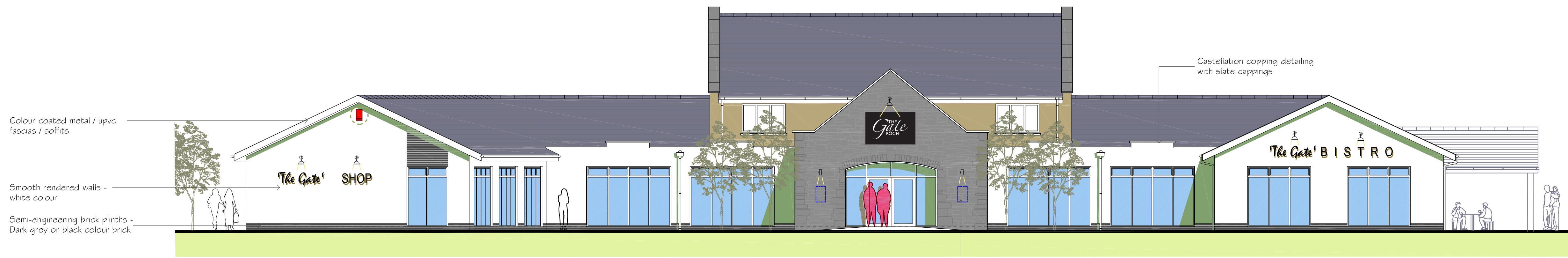
Proposed south west Elevation - 1:100

Natural random stonework entrance projections, with slate copping detailing.