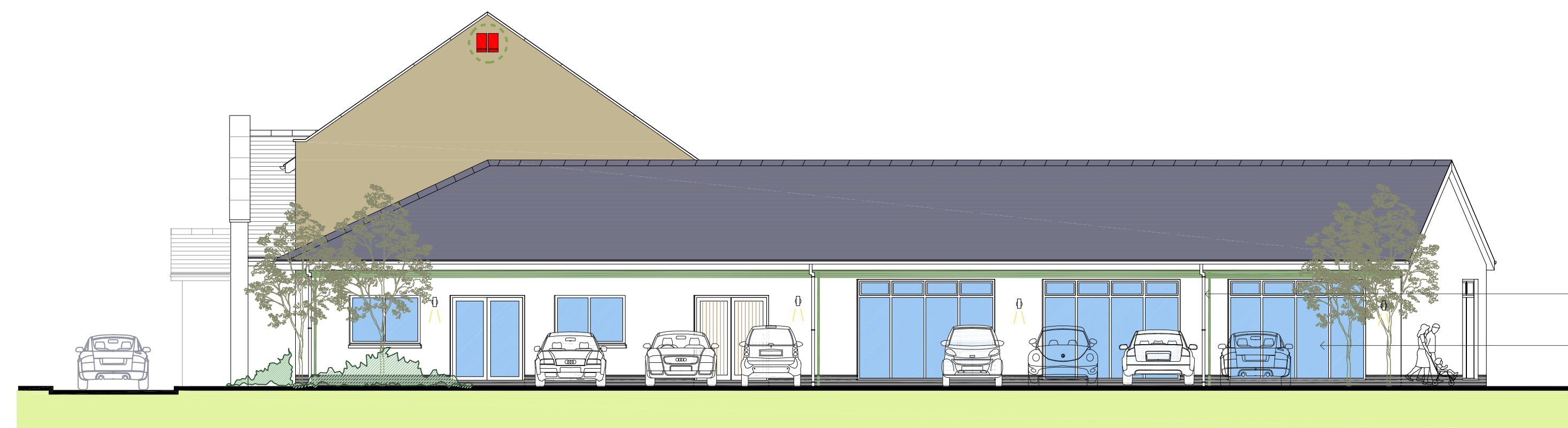
Proposed North west Elevation - 1:100

Natural random stonework entrance projections, with slate copping detailing.