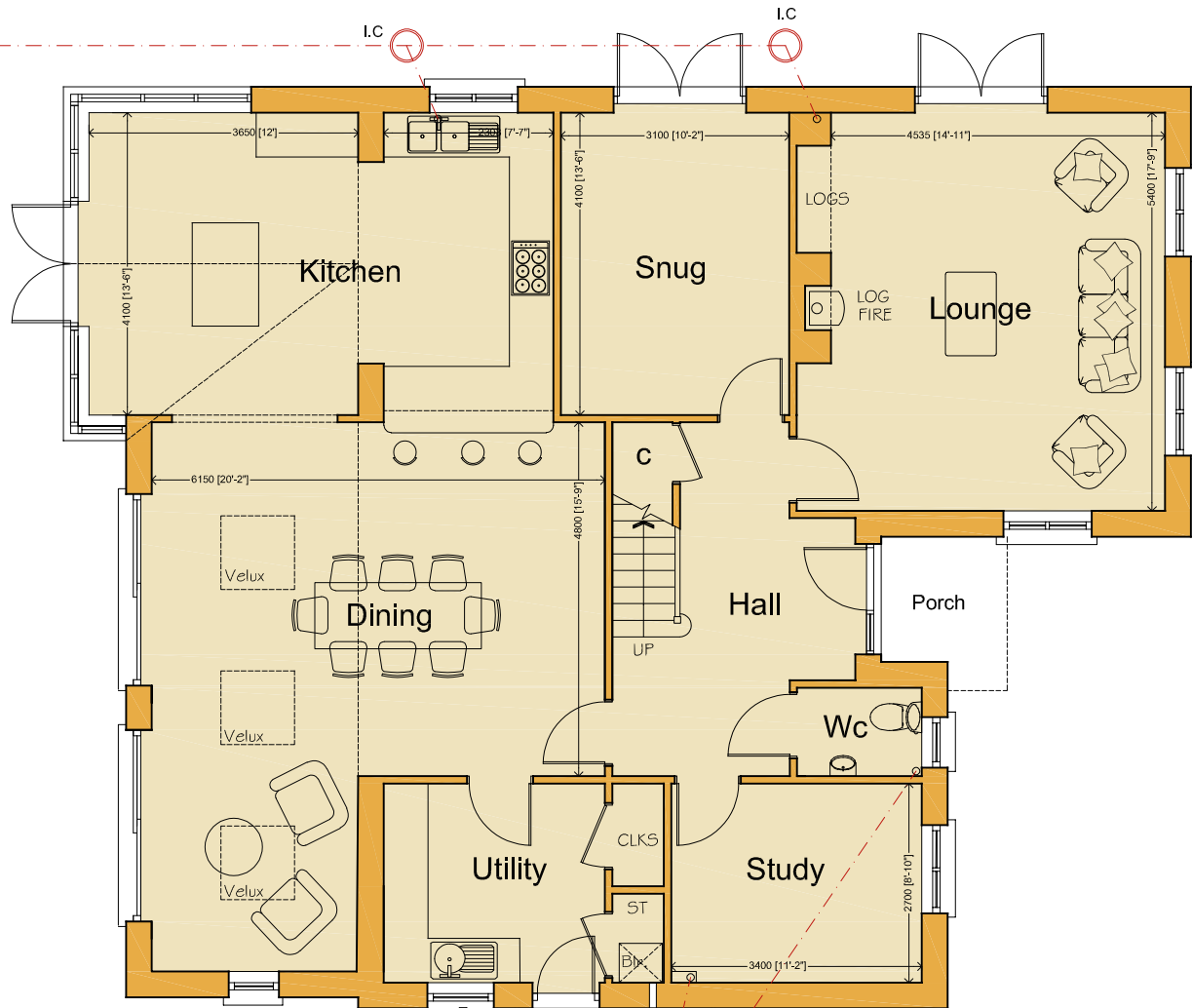
PROPOSED GROUND FLOOR