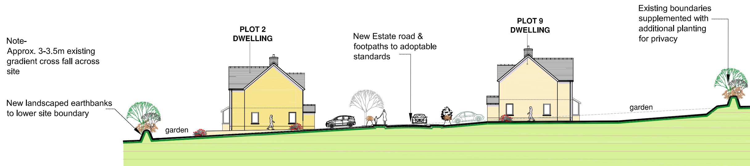
PROPOSED SITE SECTION B-B